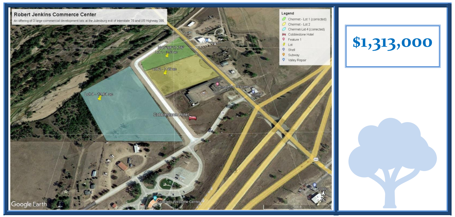
Robert Jenkins Commerce Center

O ffering 3 commercial lots just off I-76 at the Julesburg interchange near the new Cobblestone hotel, and adjacent to the south bank of the South Platte River. Lot 1 at the north end of Robert Jenkins Street has 3.53 acres ready for development. Lot 2 has 7.46 acres and sits north of the Platte Valley Inn. Both lots 1 and 2 have frontage on US Highway 385. Lot 4 has 13.64 acres and sits on the west side of Robert Jenkins Street, across from the Colorado Welcome Center. River views on Lot 1 and Lot 4.