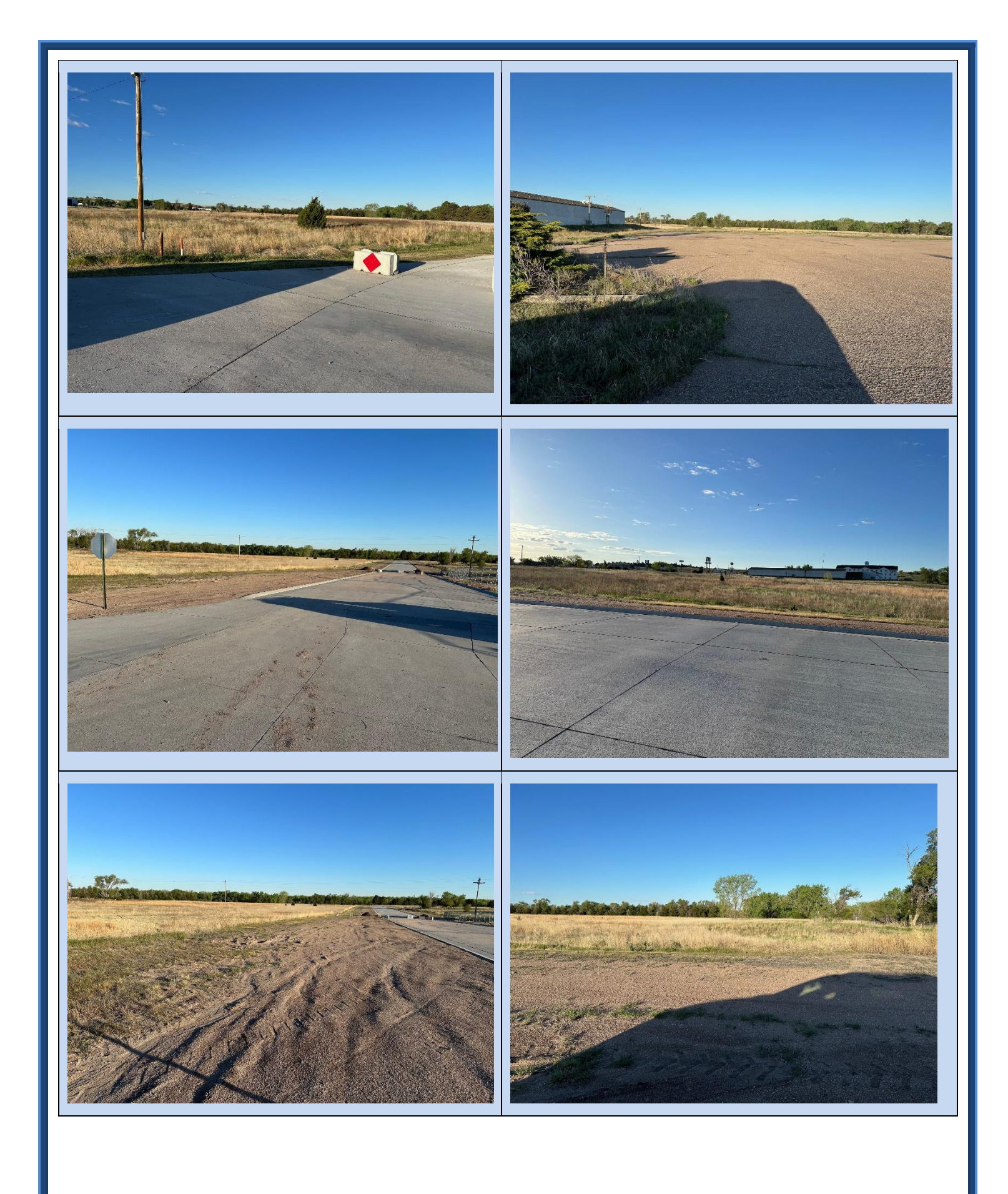
IRES MLS # 1010226 also shown on Coloproperty.com, Realtor.com, and other real estate sites